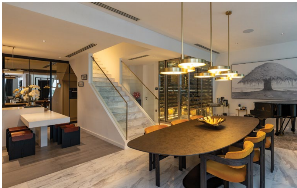
The reconfigured kitchen and dining room, with a wine room and grand piano

The architectural consideration of the new layout is evident from the ease of flow throughout the home, enhancing the overall efficiency of the indoor floor space, says Ong. “This is a very efficient use of space for a 3,789 sq ft duplex. The dining area is so spacious that it