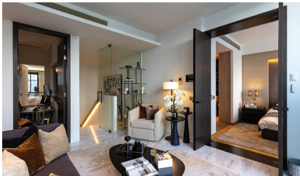
A small family area on the upper floor connects to the master bedroom suite and a study

Meanwhile, Tay has noted a rebound in the number of locals returning to the Sentosa Cove market hunting for premium properties for their own occupation. The buyers are usually those who have sold their bungalow or are seeking a different lifestyle. “With the recent measures announced, many buyers on the sidelines choosing between the mainland and Sentosa may start to see Sentosa Cove as a value opportunity,” he says. E