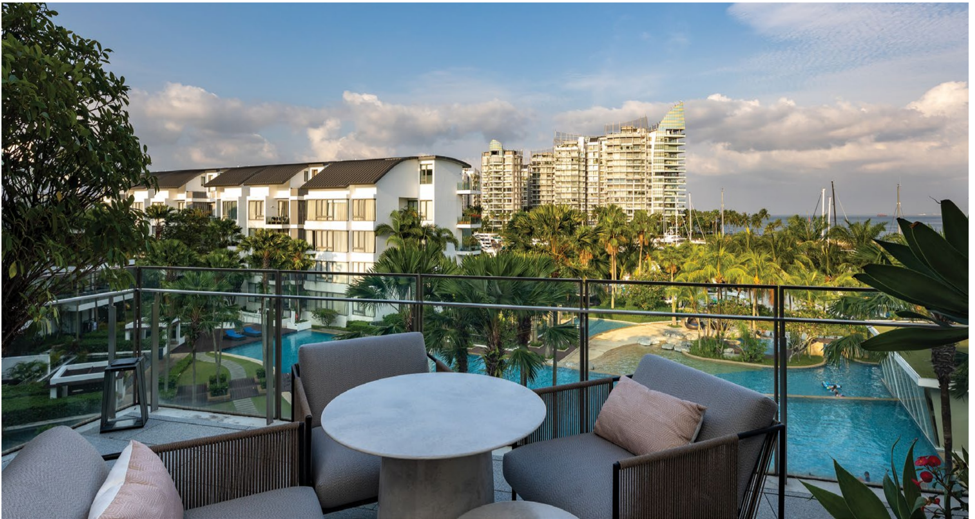
The penthouse is one of a handful at Marina Collection that enjoy unblocked views of the marina and the sea

comfortably accommodates a Steinway grand piano.”