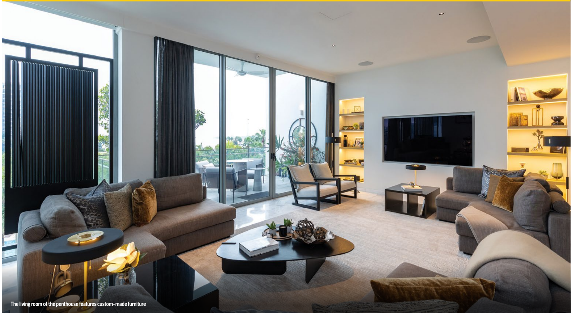
The living room of the penthouse features custom-made furniture