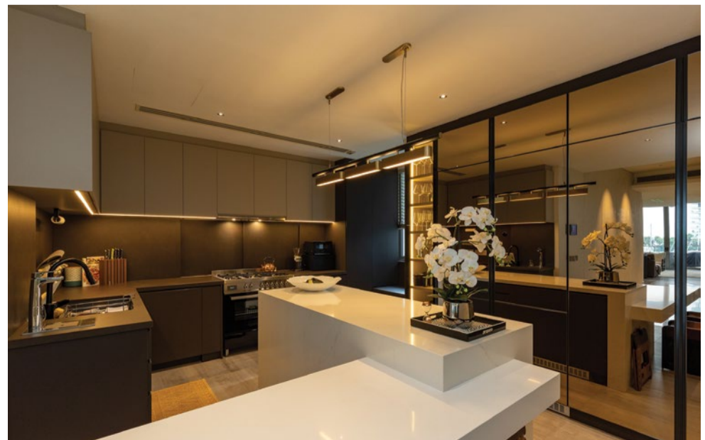
The open-concept kitchen is anchored by an L-shaped island, and has luxurious fittings and appliances